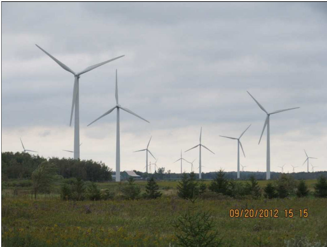
Hwy 89, Melancthon Township, Ontario, Canada